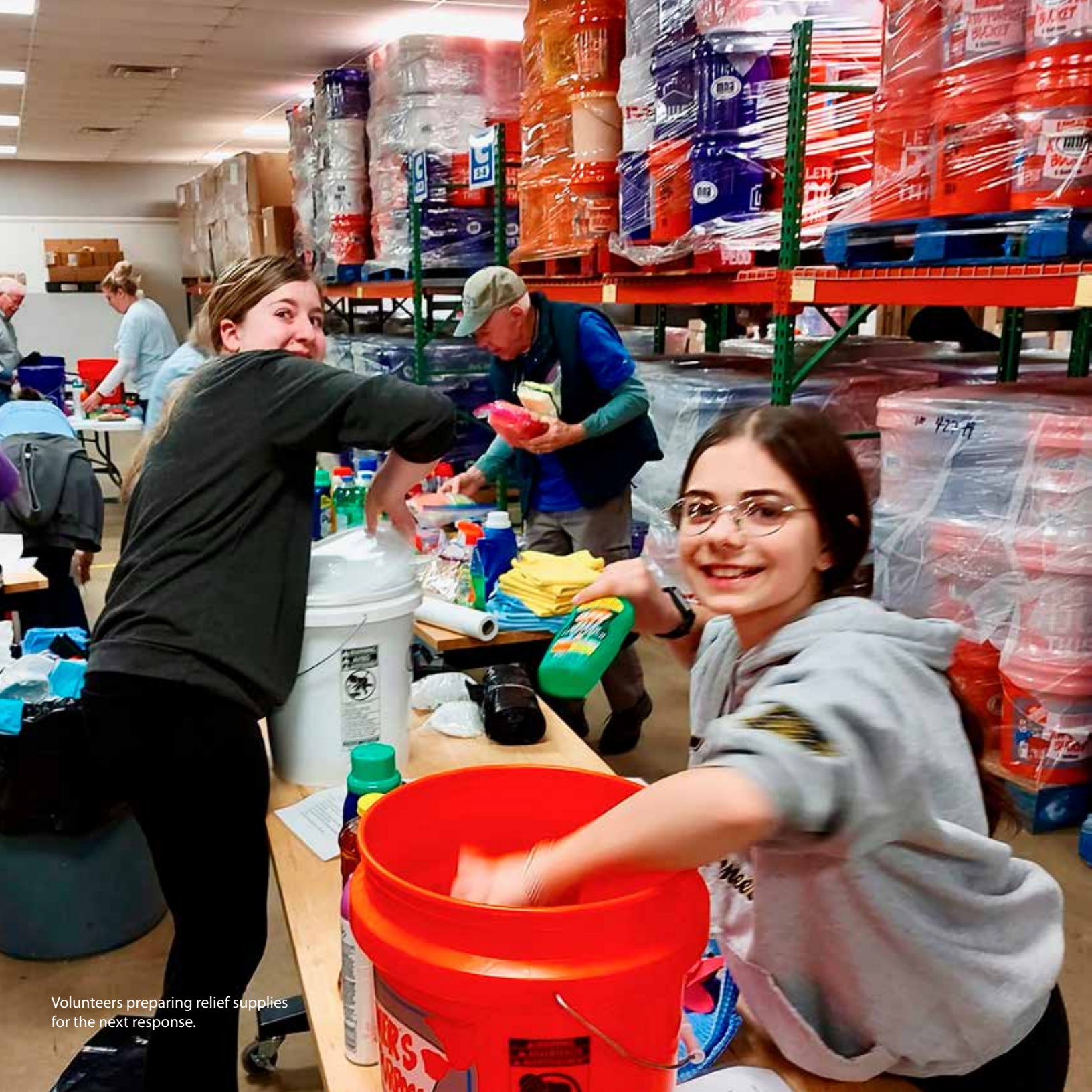
Volunteers preparing relief supplies for the next response.